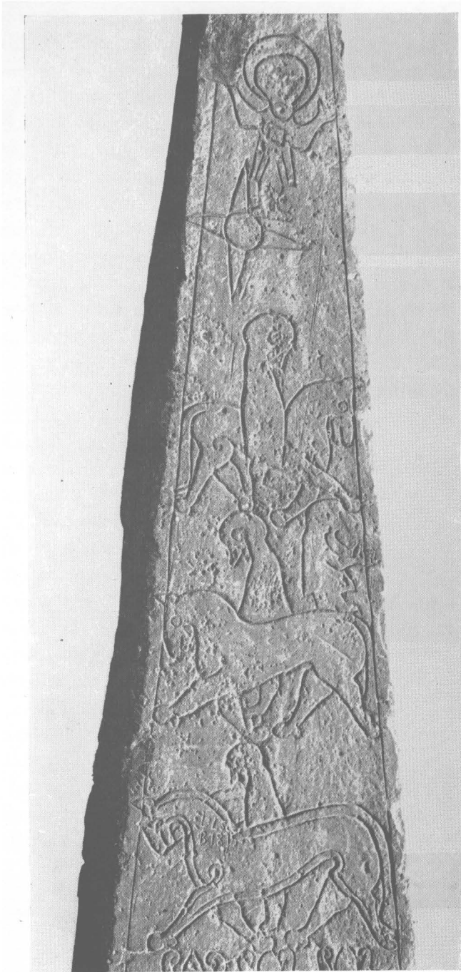
Pl. 2 The Dynna stone: detail