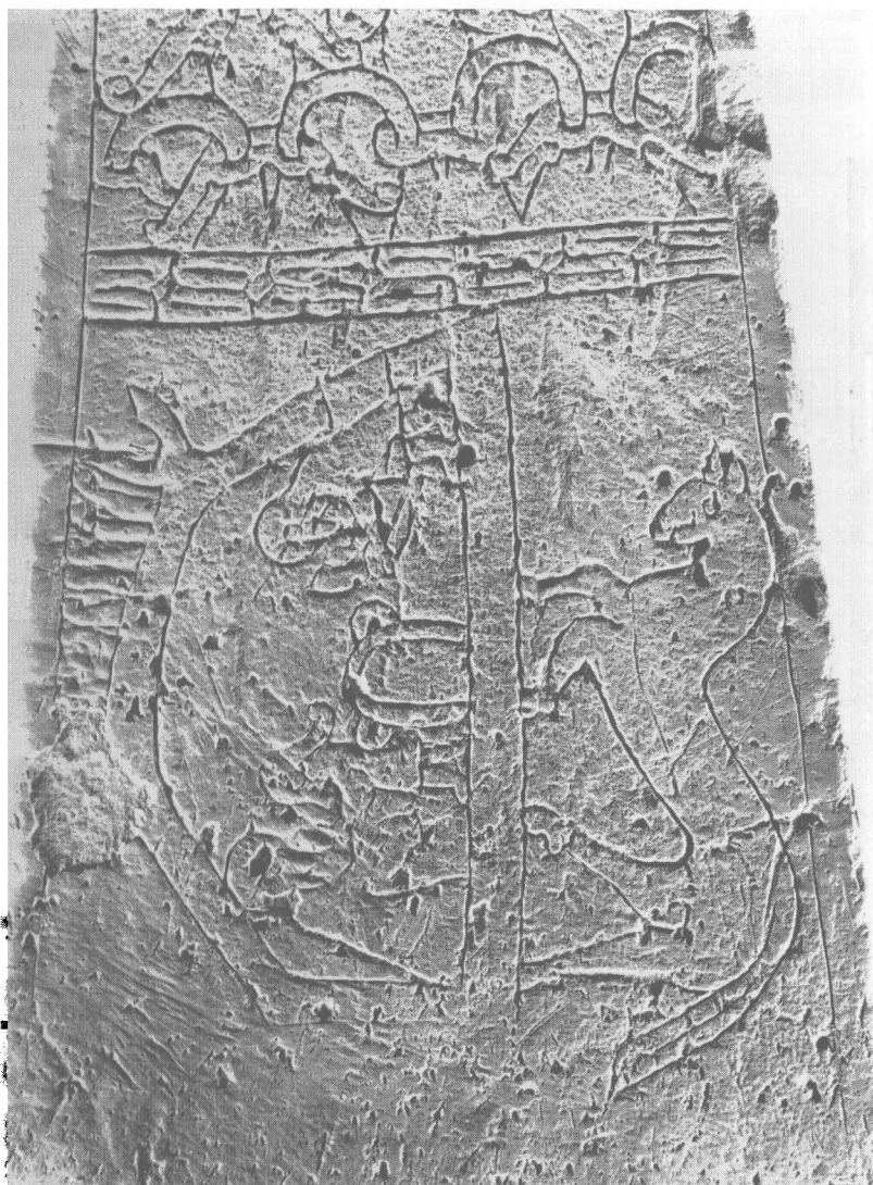
Pl. 3 The Dynna stone: detail