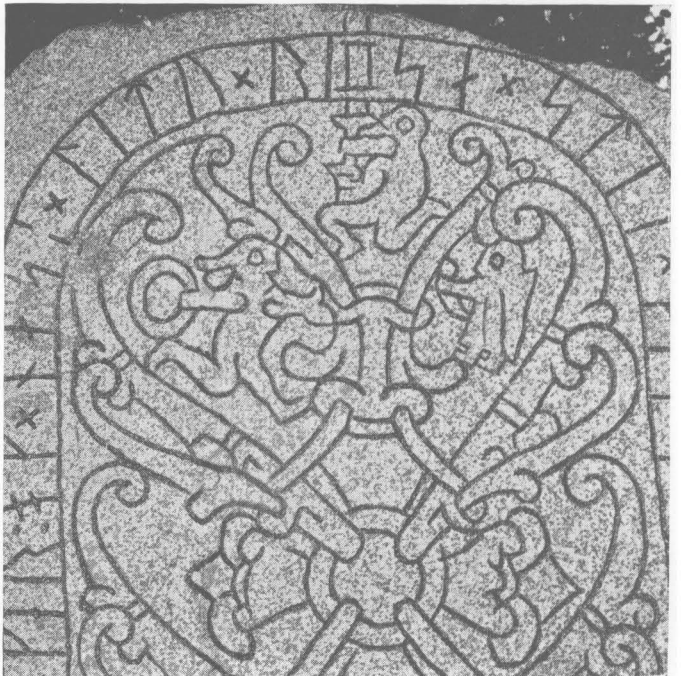
Pl. 5 The Drävle stone